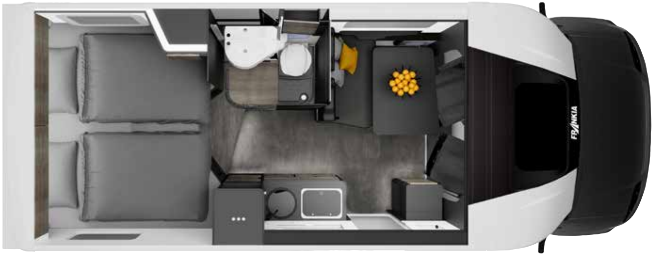
FRANKIA NOW 7.0 L 3.5 T

FRANKIA NOW is ideal for families, with comfortable twin beds, an additional power drop-down bed and four seats with seatbelts. Perfect for couples: the alternative front section for even more space.